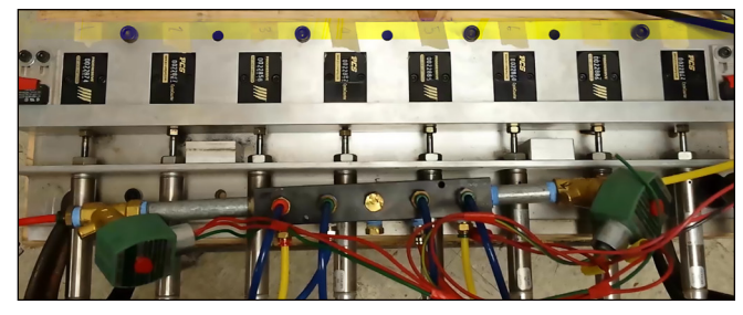
Durability testing was conducted through an independent testing facility to determine the failure point of various mold counters. To view testing data, videos and more visit www.procomps.com/CounterView.

Some 'counterfeit' copies have emerged, so in addition to legal actions, Progressive had these units evaluated by an independent testing company. When compared to brands of similar design, results revealed that Progressive's CounterView far outperformed all others by returning with more than 3 million cycles with no failure. The following chart